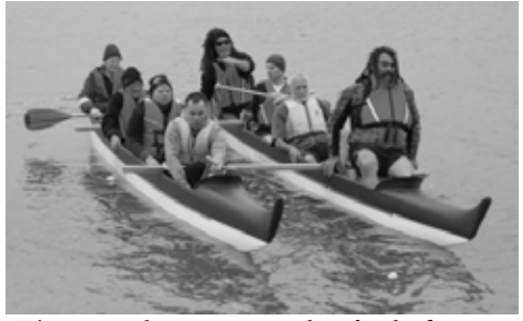
The new waka, Huriawa sailing for the first time