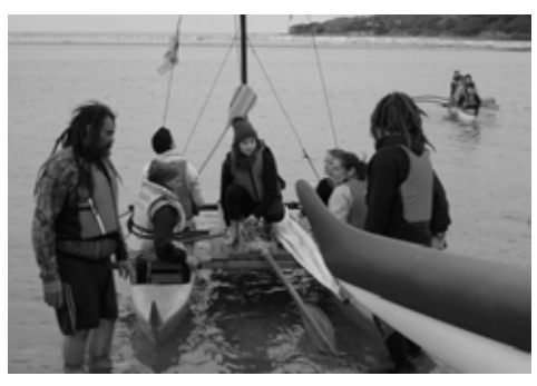
Hauteruruku getting ready to tow Huriawa out